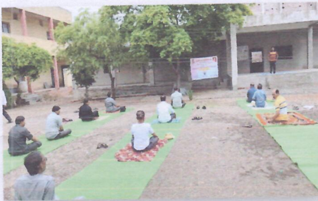
Student & Staff performing Yoga at Campus

Firstly our college staff and student participated in the Yoga Session. Also on Occasion of 'Yoga Day' we arranged Online Quiz to Spread awareness about yoga and its benefits among society through students.