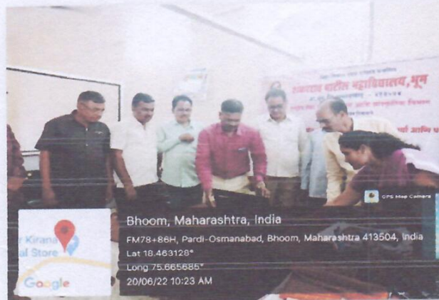
Inauguration of Online E-Quiz